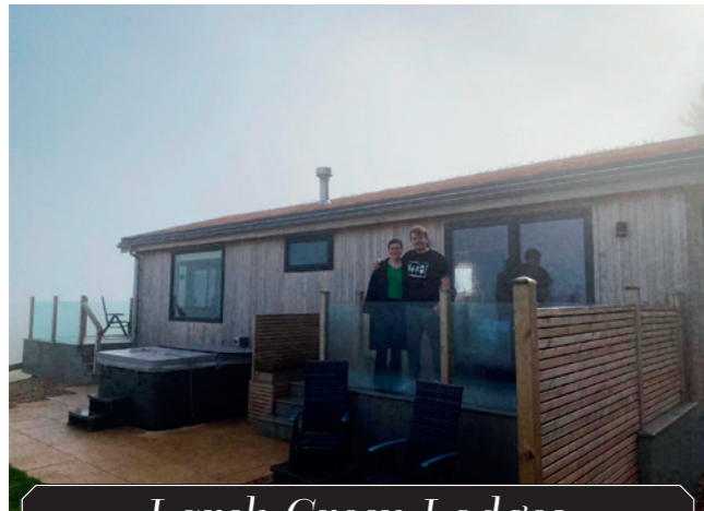
Larch Green Lodges

Whether it's a forest bothy or an eco-friendly lodge, our subscribers have visited some beautiful destinations that are leading the way for green tourism