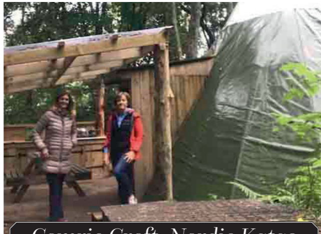
Comrie Croft, Nordic Katas

UNDERCRAIGS FARM, Old Greenock Road, Renfrewshire PA14 6YS. www.larchgreenlodges.com Prices from £420 for two nights min.